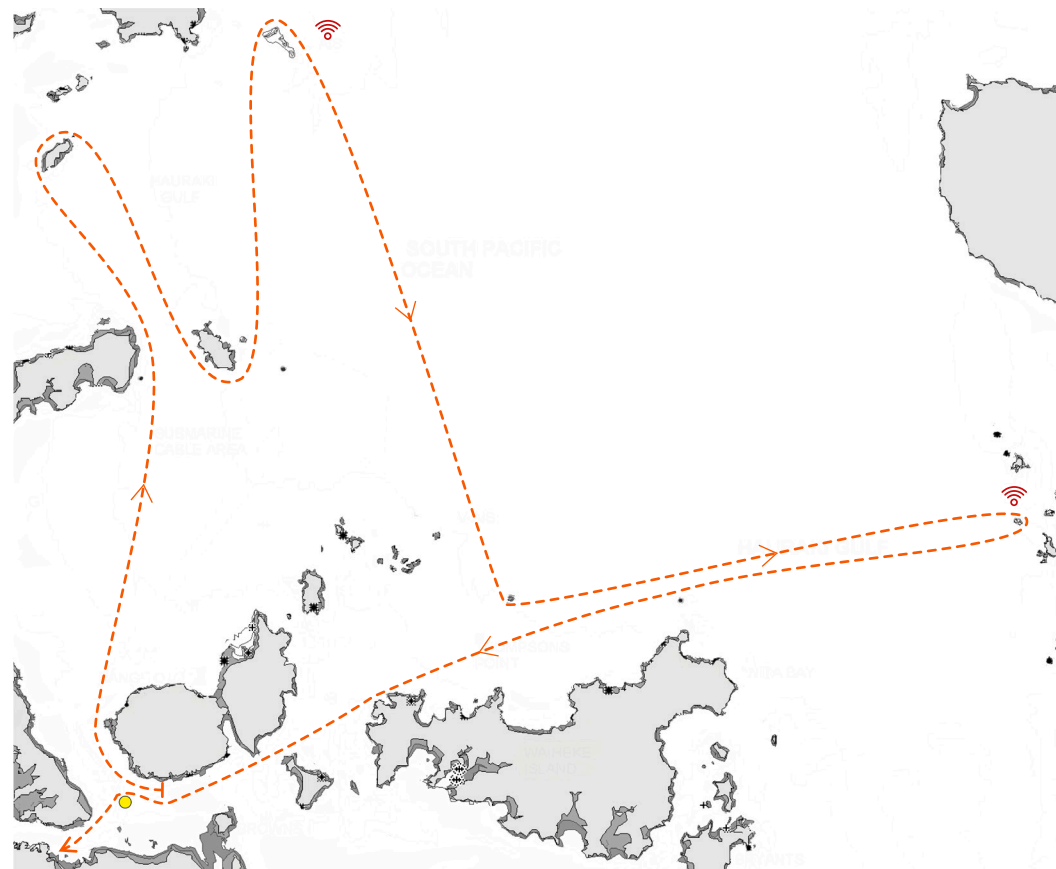
COURSE 2: Beacon Marine 100 Course (105nm)

Reply MARK 1 to SSANZ Text message after passing and/or rounding Flat Rock